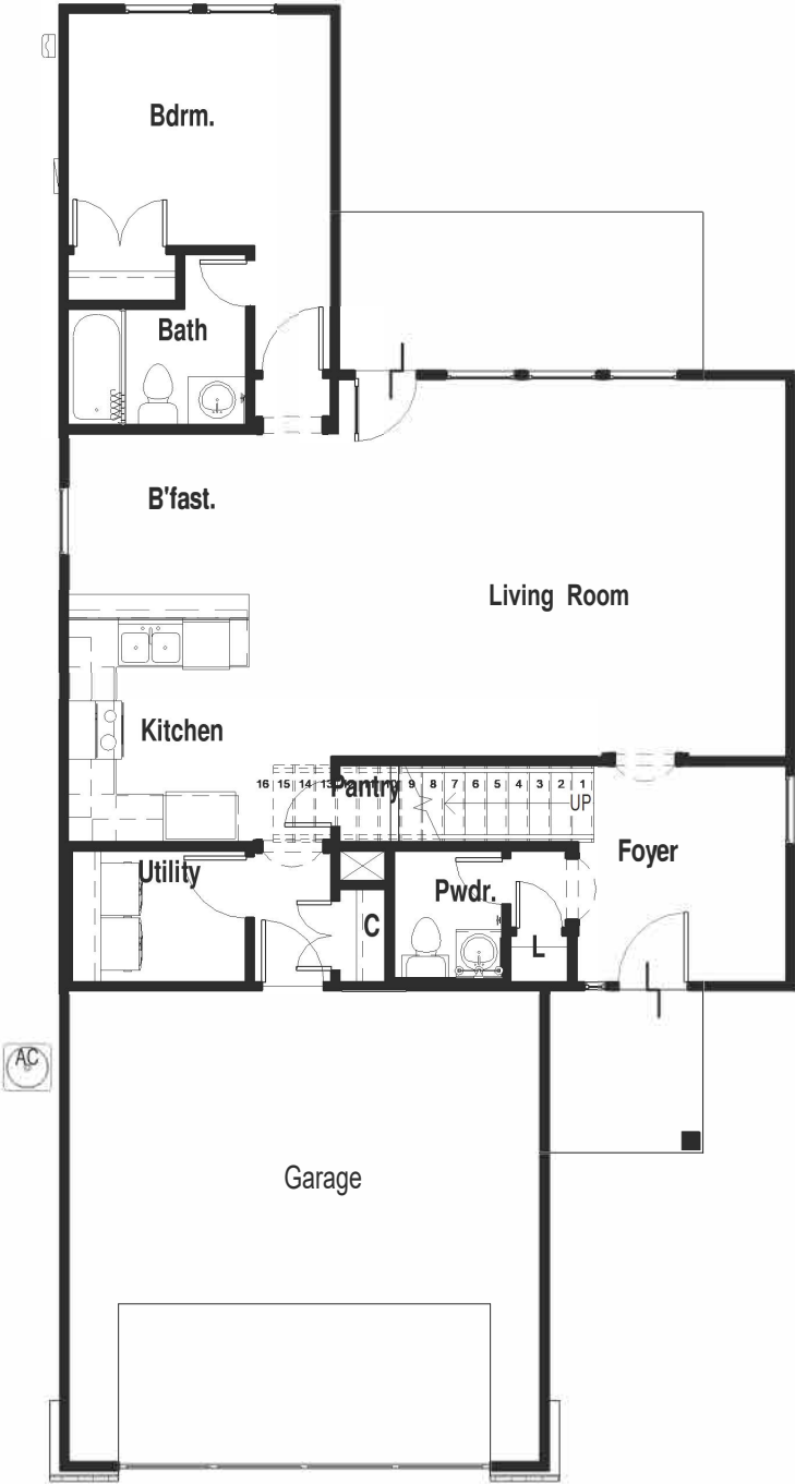
① FIRST FLOOR PLAN - BROCHURE